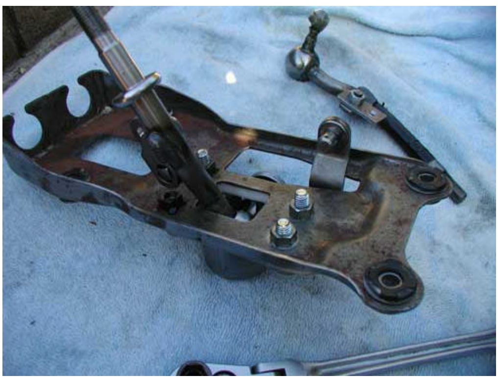
Installation in the car is the reverse of removal.

8. Install the lever assembly using the three longer bolts and one of the original bolts. The short bolt goes in the rear, right side hole.